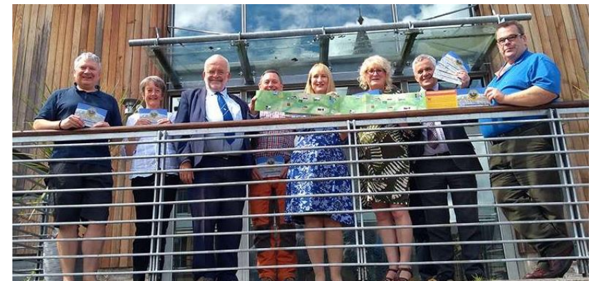
Highland Mainline CRP promoting their line