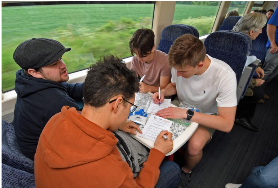
Kent CRP event with Ashford College students in Community Rail Week