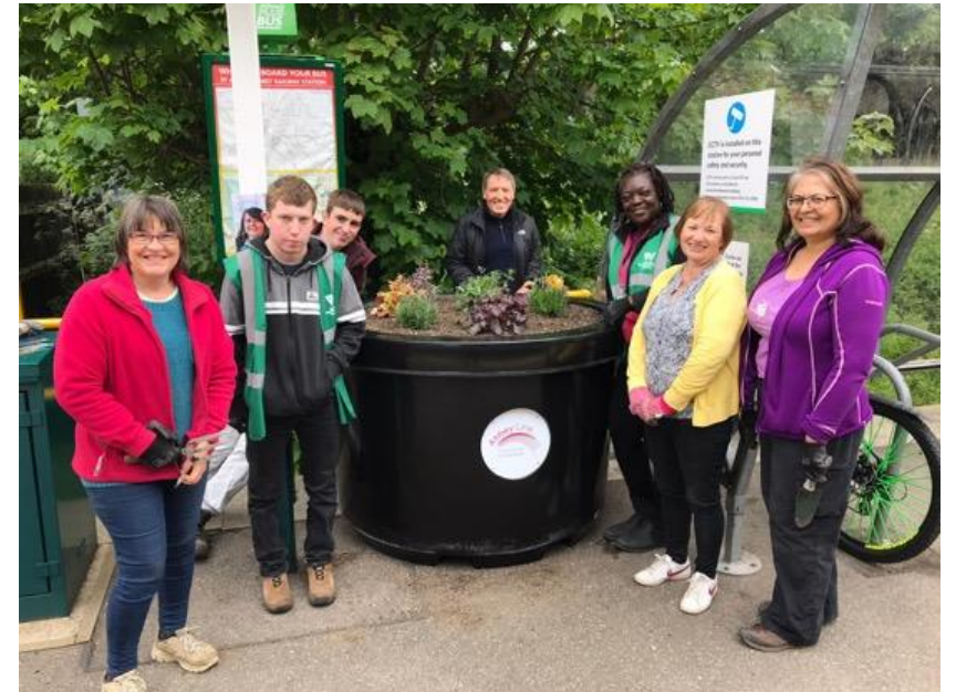
Abbey Line CRP, Bee Friendly Trust, Watford Mencap & London Northwestern wildlife-friendly planting & new signage