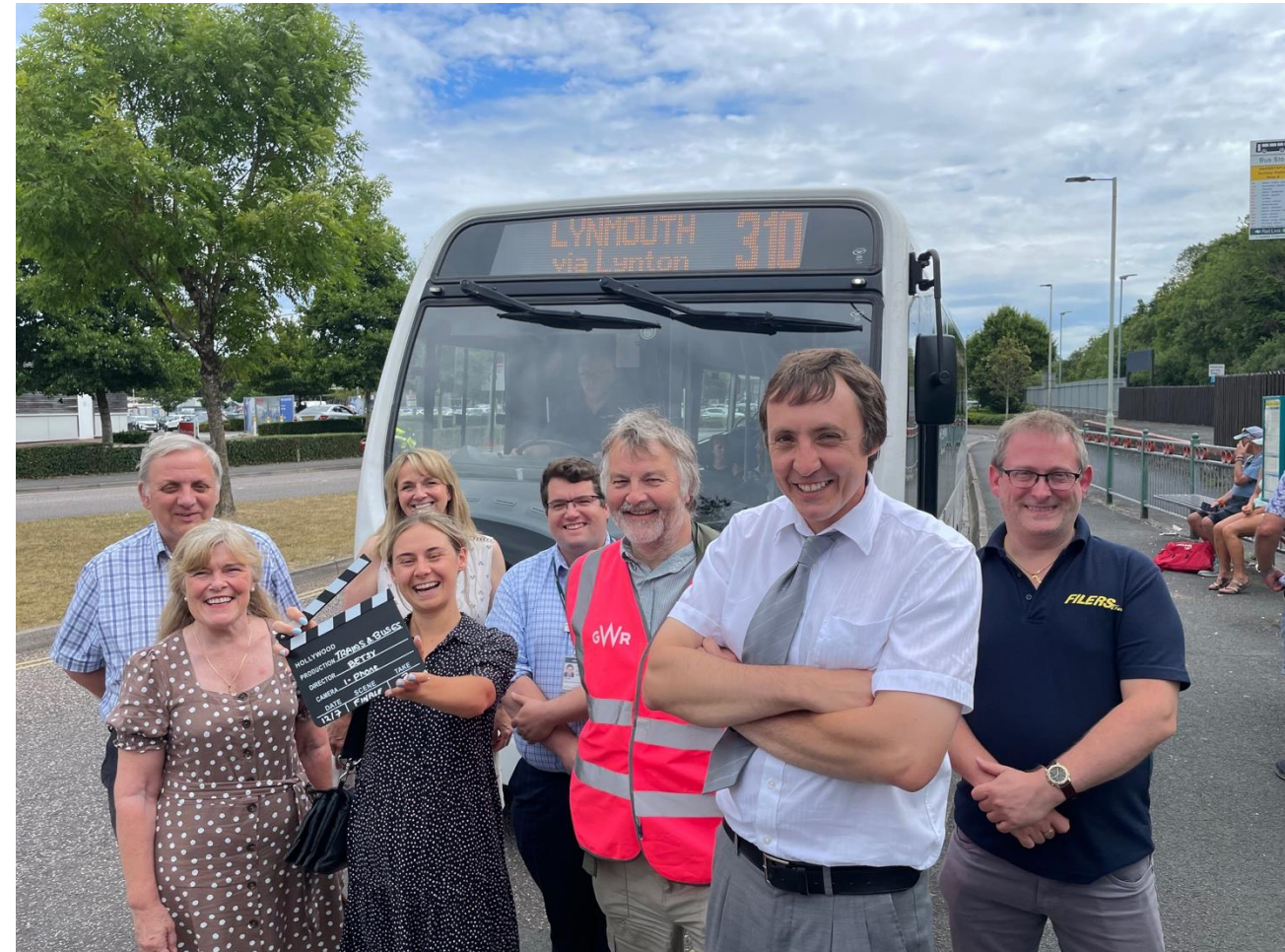
Devon and Cornwall Rail Partnership premiere at Barnstaple Station showcasing new promotional videos