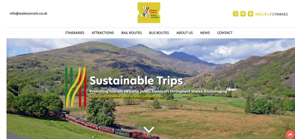
Wales on Rails campaign (Wales & Borders CRPs and Great Little Trains of Wales)