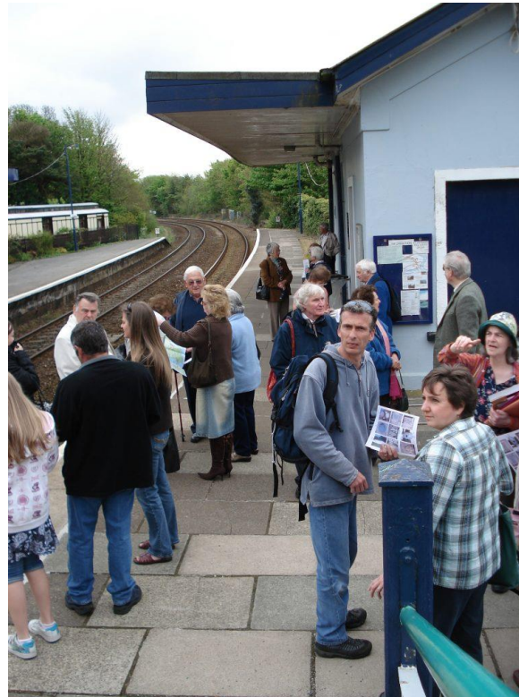
St Germans & Area Public Transport Group consultation on travel needs