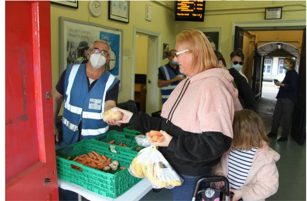
Three Rivers CRP's Swathling Station Freeshop

>> The need to come together, build hope & positive visions