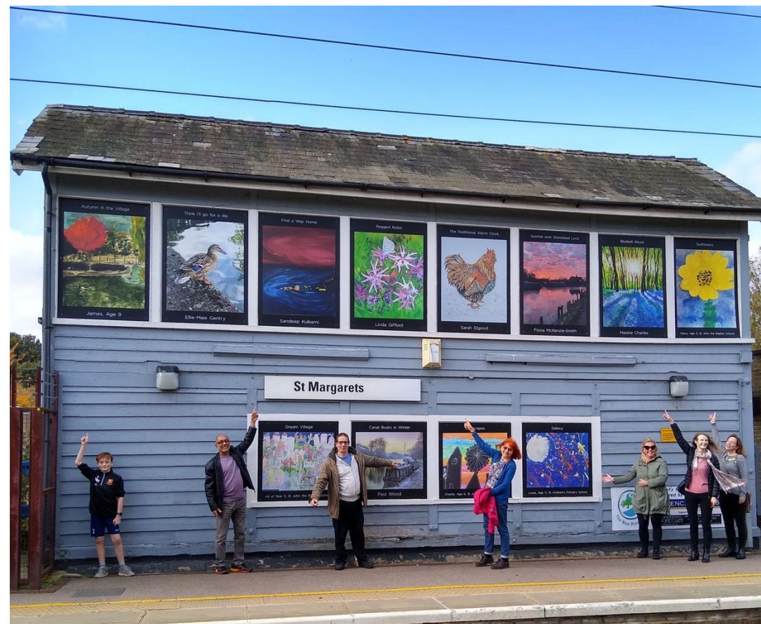
New River Line CRP's 'Art @ The Station' project