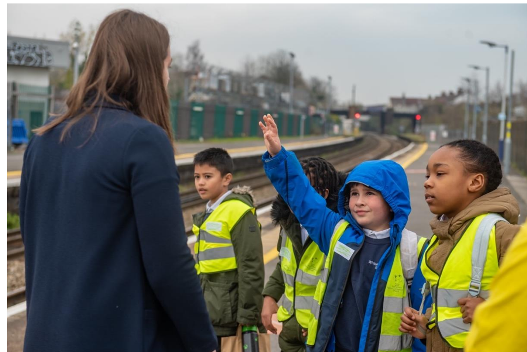
Platform Rail community education scheme (Sevenside, Gloucestershire, Worcestershire, and Transwilt Community Rail Partnerships)