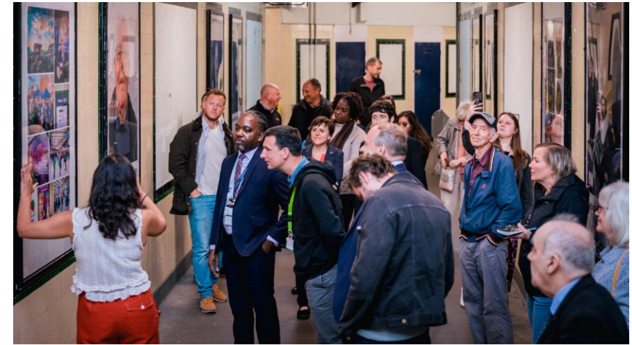
Community Train CRP launch at Tolworth, in Community Rail Week