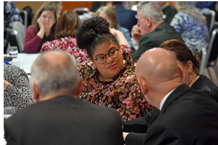
Community Rail Conference, March 2023

>> A chance to be creative and challenge ourselves & each other