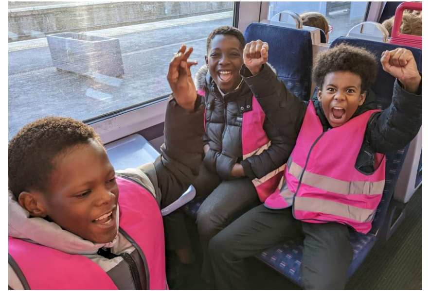
Platform Rail trip to Bristol