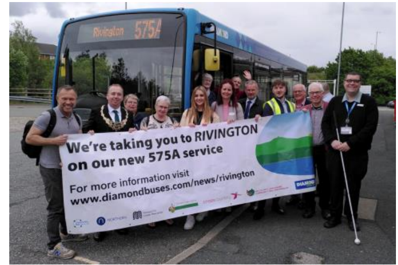
South East Lancashire's Rivington Rambler