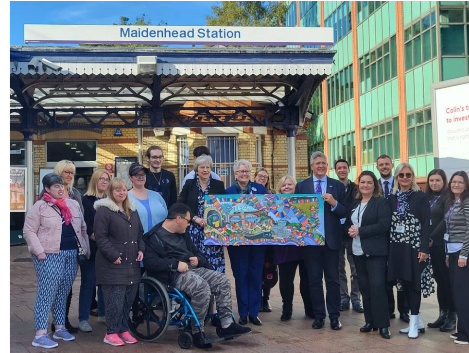
Southeast Communities Rail Partnership & local partners, Maidenhead