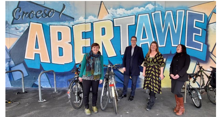
Meeting Lee Waters MS, Welsh Government Deputy Minister, with South West Wales Connected and Wales & Borders CRPs