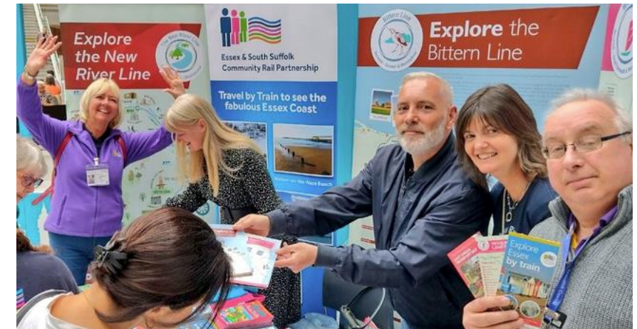
New River Line, Essex & South Suffolk & Bittern Line CRPs promoting their lines