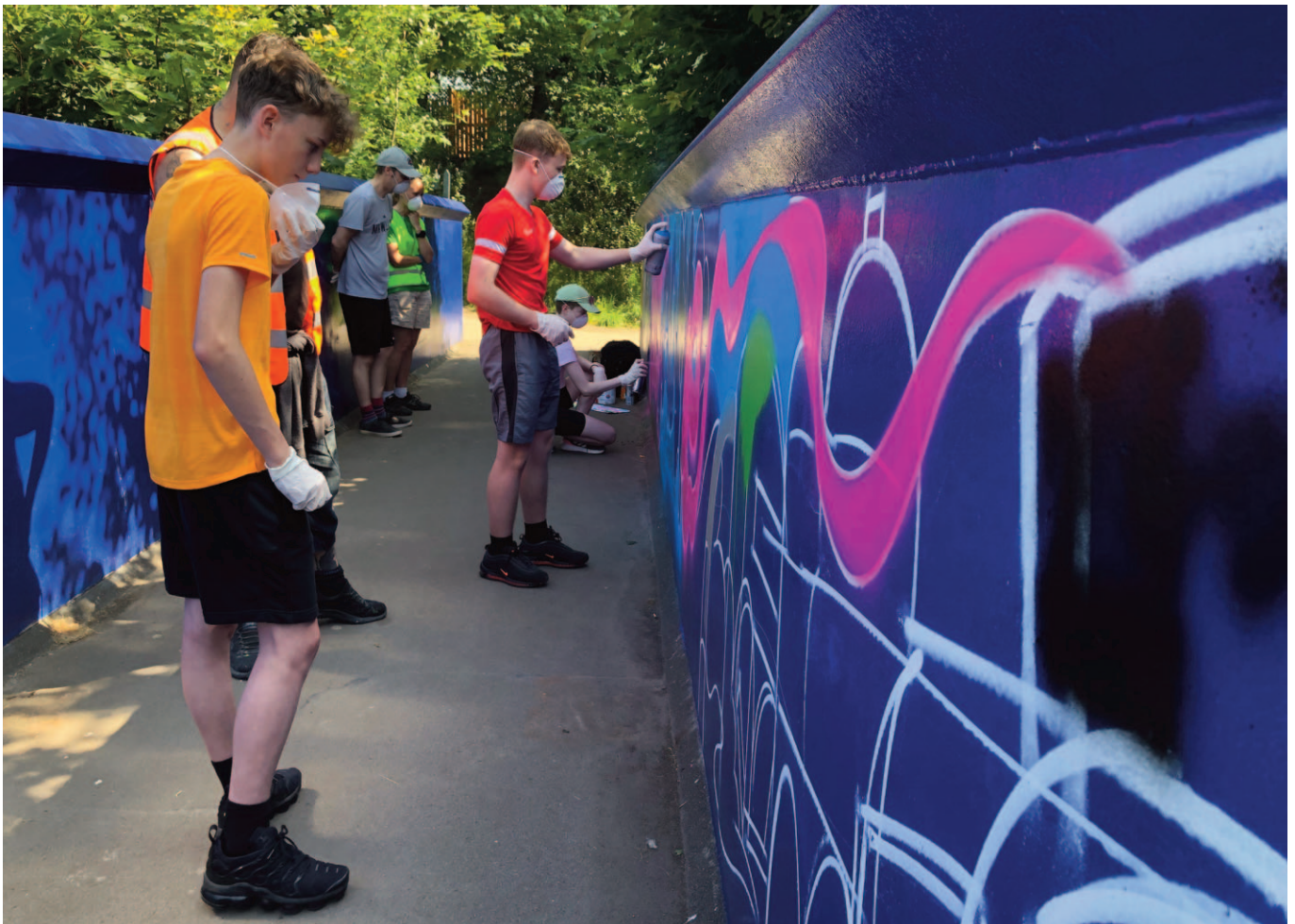
Pic – Bishop Line CRP