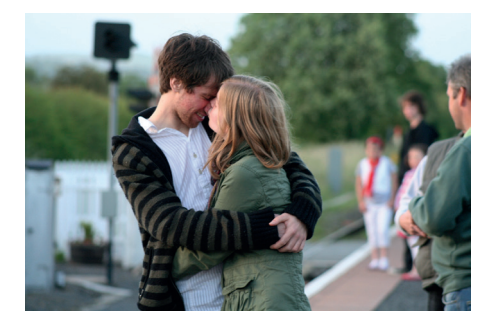
2008 winner – Until We Meet Again by Geraint Morgan