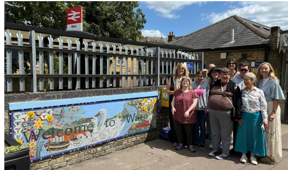
New River Line CRP

>> Please share evidence of your impact!