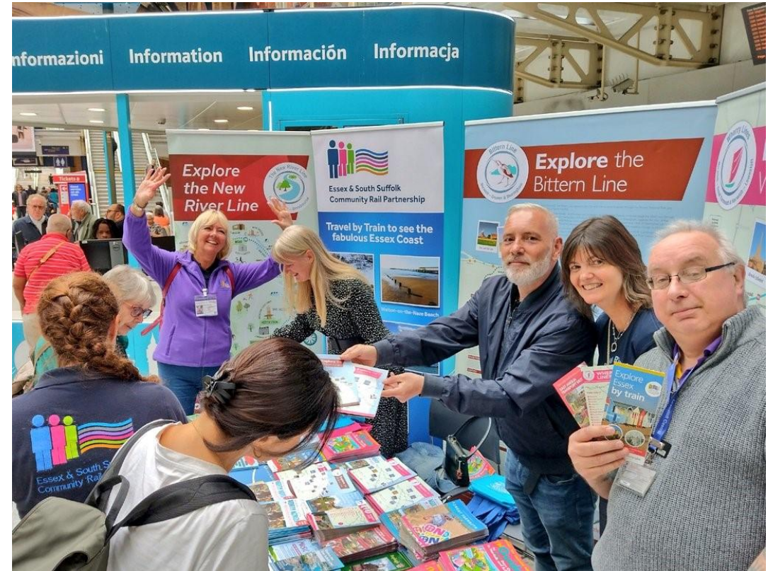
CRPs at London Liverpool Street during Community Rail Week

Keep talking to us: communityrail.org.uk/about-us/ our-team-and-board/