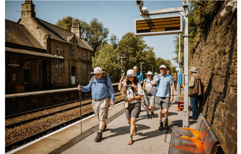
High Peak & Hope Valley