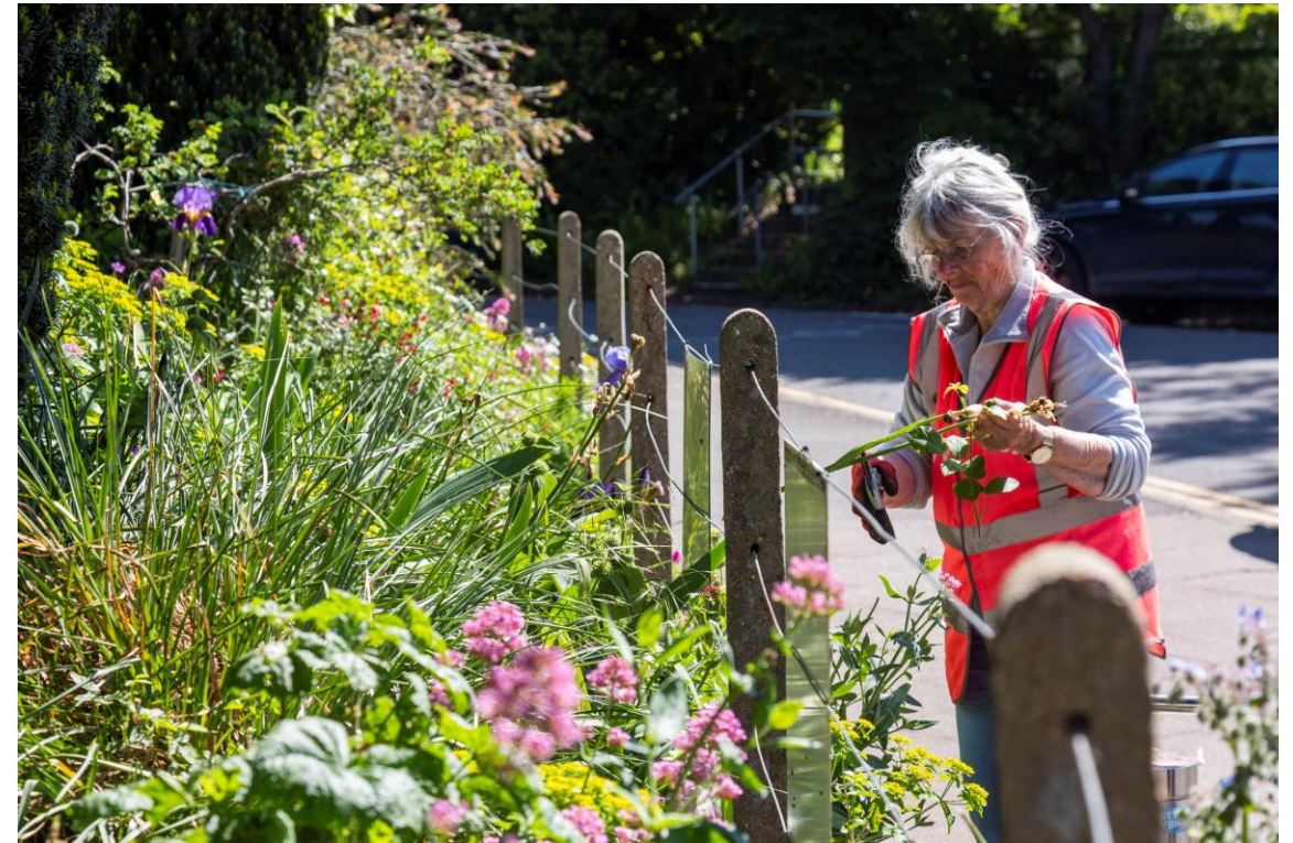
Yatton Station Volunteers

86% said we communicate well with members