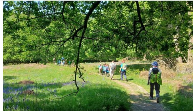
Thread Your Way Along the Steel Cotton Rail Trail, the new station to station walking trail through the Peak District

"The new long-distance Steel Cotton Rail Trail links together the stunning walking destinations throughout the very beautiful High Peak and Hope Valley areas"